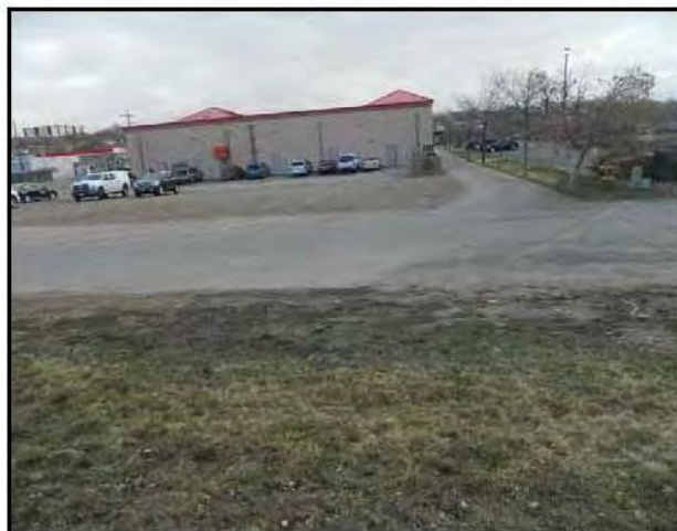
2. View of the property, facing east.