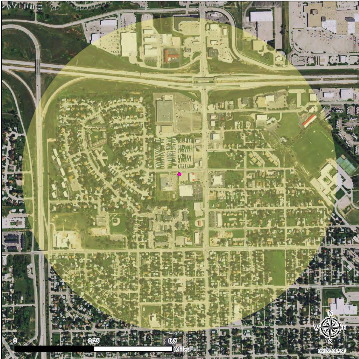
Figure 2. Aerial photo of project direct and visual APE. Proposed tower location/Direct APE is shown as pink dot. Yellow highlight is the visual APE. Note area is previously disturbed by urban development.

No archeological resources are previously recorded within the direct APE and the area has been completely disturbed.