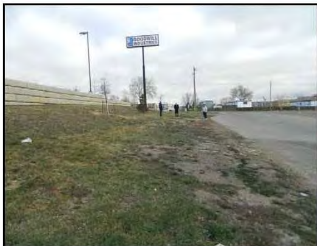
1. View of the property, facing north.