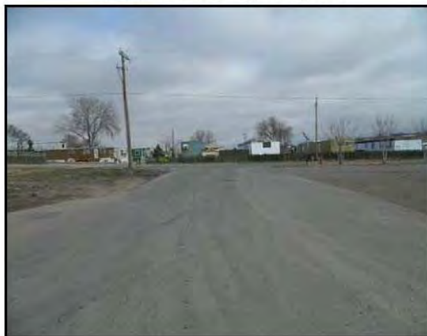
6. View of the access, facing north from the property.