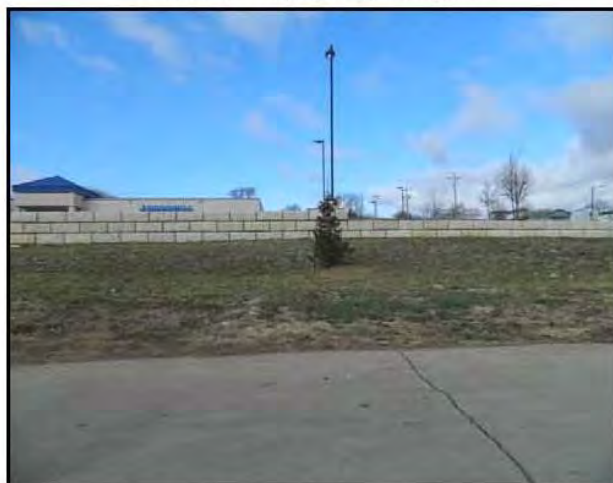
4. View of the property, facing west.