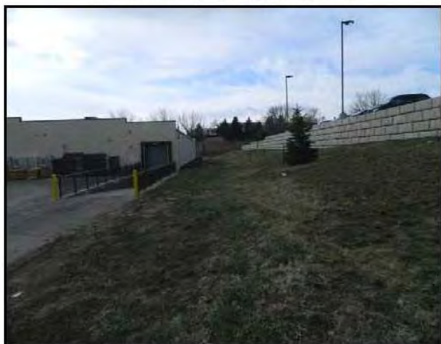
3. View of the property, facing south.