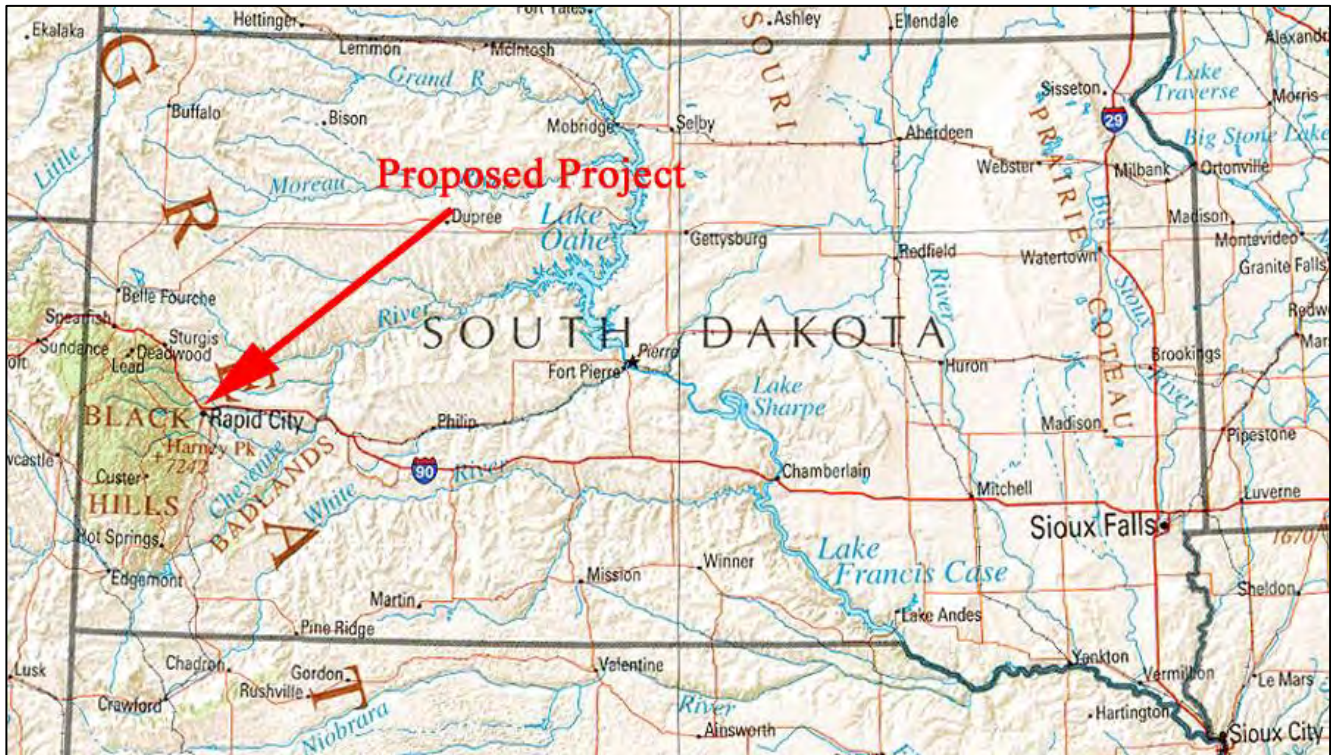
Figure 3. General location of proposed project within South Dakota.