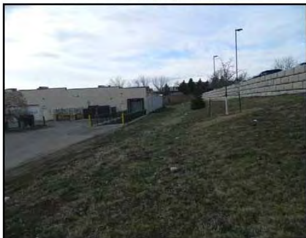
5. Overview of the property, facing south.